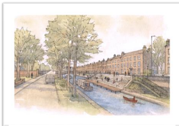
Proposed view of the marketplace. Credit: Greig and Stephenson Architects

Based on the feedback you've already shared with us, and what we hear in this consultation, we will finalise a submission to government that sets out the priorities for how the Plan for Neighbourhoods funding will be invested in Spalding. We have to submit this by 28 th November – we'll keep you posted.