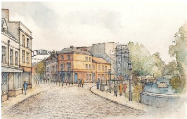
Proposed view of Bridge Street Credit: Greig and Stephenson Architects