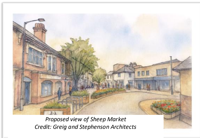
Proposed view of Sheep Market

You can have your say in the survey here: Love Spalding? Have your say and help to shape its future. Survey Or if you want a printed copy of the survey you can email us Spalding.TownBoard@sholland.gov.uk Printed copies of the survey will also be available with the copies of the booklet which will be made available in the venues mentioned above.