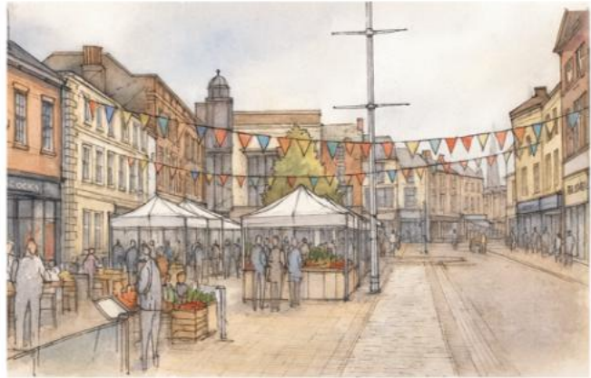
Proposed view of the marketplace. Credit: Greig and Stephenson Architects

The outline plans that have been drawn up for Spalding aim to make it an even better place to live, visit, work, and spend time. And crucially, these proposals have been informed by the community, including from feedback captured in our consultation in 2024 and, more recently, in a survey carried out on behalf of the government.